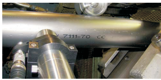
Ink: black TMC-SW 010