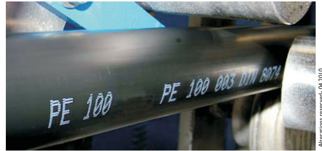
Ink: white, pigmented TAEC-WS 010